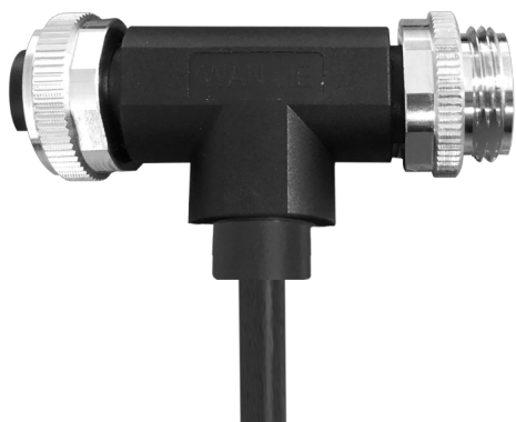
7/8" T Type Male-Female Molded With Cable