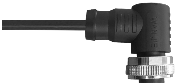
7/8" Female Molded Cables, Angled