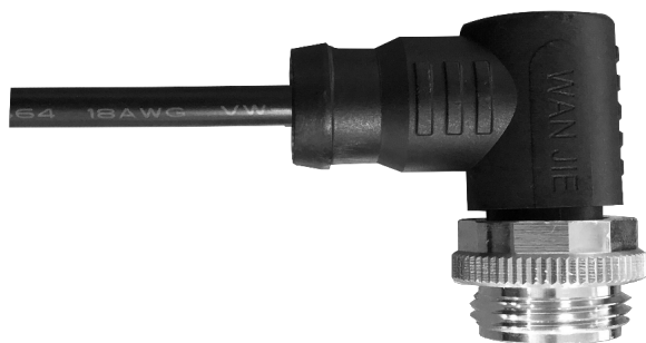
7/8" Male Molded Cables, Angled